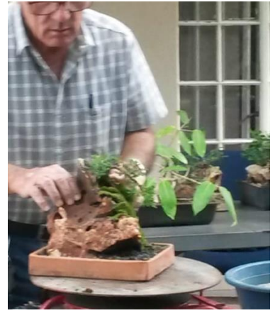
A little tree grown from cutting. Planted a month on rock. Andre adds moss for detail and to keep soil from being washed off when watered (wrap roots and moss in cling wrap).