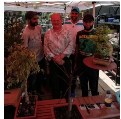
Garden Shop Parktown nursery exhibition and public engagement