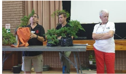
March BRAT Talk on cascade style