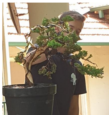
November-Shaundre provides feedback on ABC5