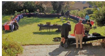
June- Winter exhibition