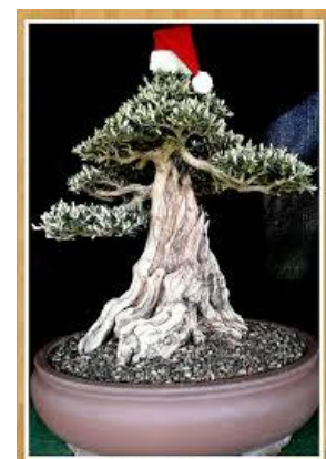
December- End of year workshop