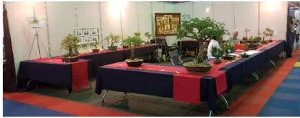
March Hobby X Exhibition